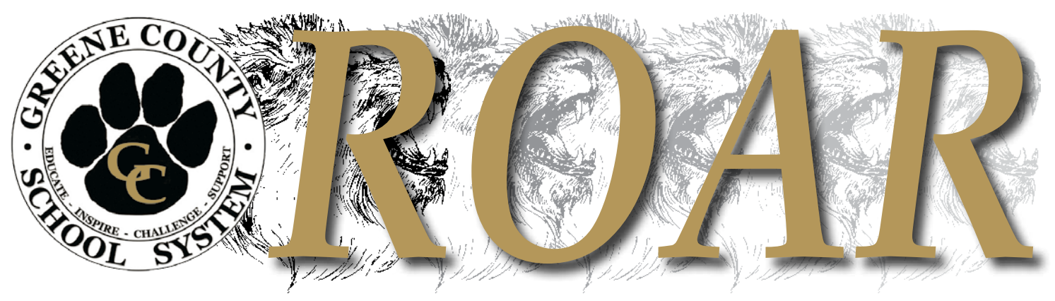
Greene County School System SUMMER 2017