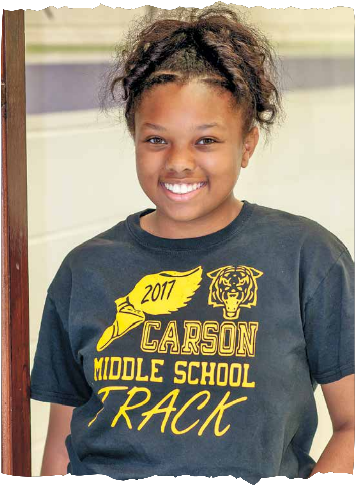
Academics, the arts and sports are important at Greene County Schools.