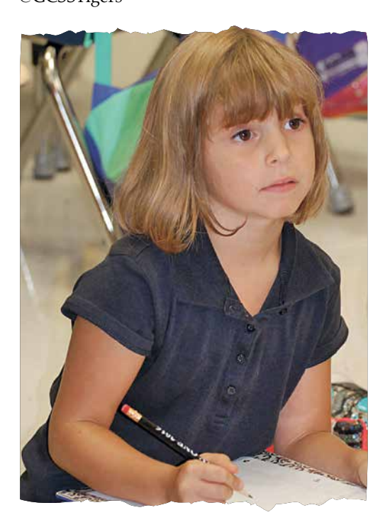
Classrooms are full of students eager to learn and highly qualified staff eager to teach!