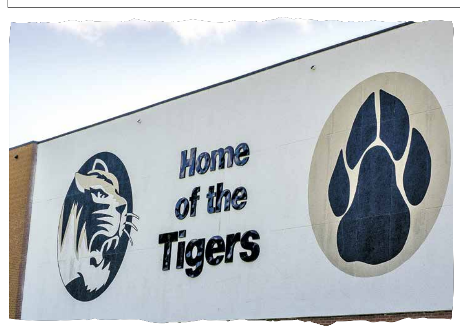
Greene County Schools - Home of the Tigers!