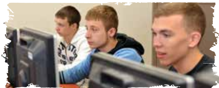
Conotton Valley is focused on providing all learners with skills to adapt intellectually and socially to their changing environment.