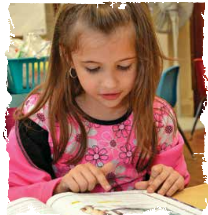
Engaged and hard-working students are a typical site at Conotton Valley Elementary!

The 2015-16 school year is also bringing "All in Mondays!" Please look for more information about this surprise in August! Until then, enjoy the rest of your summer!