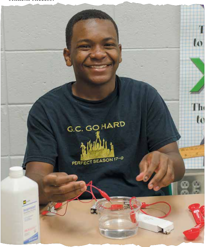
Engagement with teachers and class participation are beneficial for students to learn to their full potential.