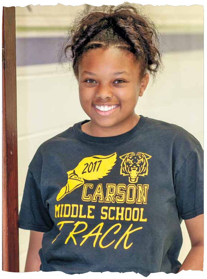
Academics, the arts and sports are important at Greene County Schools.